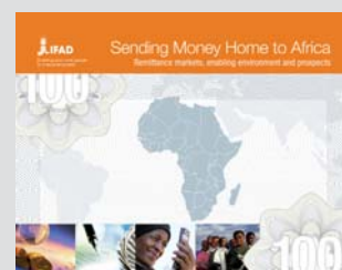
Sending Money Home to Africa was presented at the Global Forum on Remittances 2009, in Tunis, Tunisia, on 22-23 October.