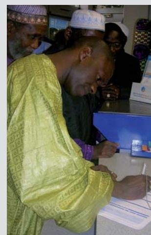
IFAD report explores how remittances can be catalysed through MFIs and postal offices.